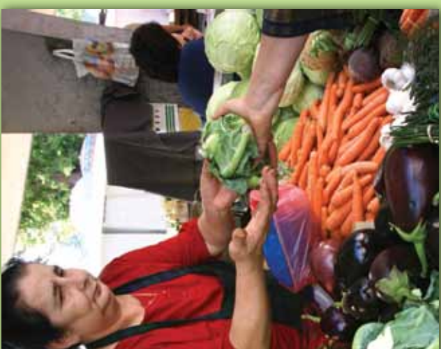
Gardening is a business for some growers. Visit a farmers' market and you'll meet them.