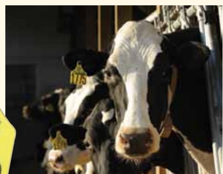
Farmers can swipe ear tags to track animal blood lines, health, age, vaccinations, milk production, weight and more. When the animal leaves the farm, it can be traced all the way through processing.