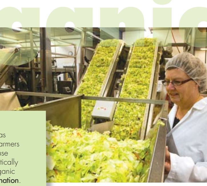
Packaging organic salad mix

Organic meat, poultry, eggs and dairy products come from animals that eat organic feed. These animals must also be allowed to go outdoors. Cows, sheep or goats must be allowed to pasture graze, which is a natural behavior for them. In the United States, no organic animals may be given medicated feed, antibiotics or artificial hormones.