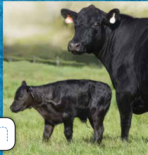
beef cow and calf